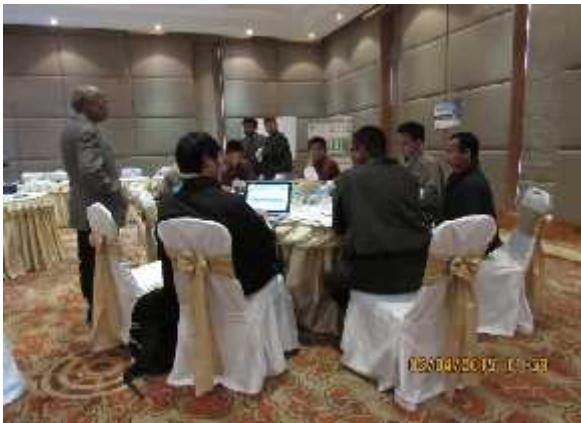
Fig 4. Group Discussion: Group 1