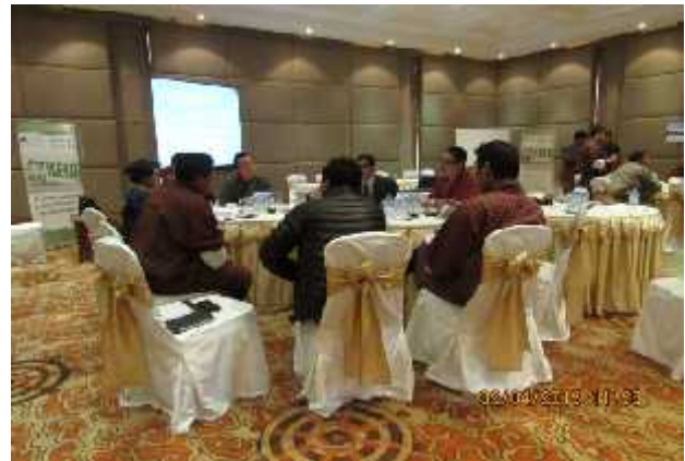
Fig 5. Group Discussion: Group 2