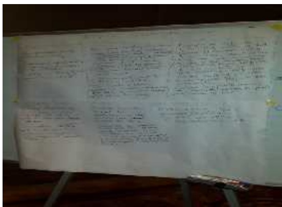
Fig 6. Output by group 1