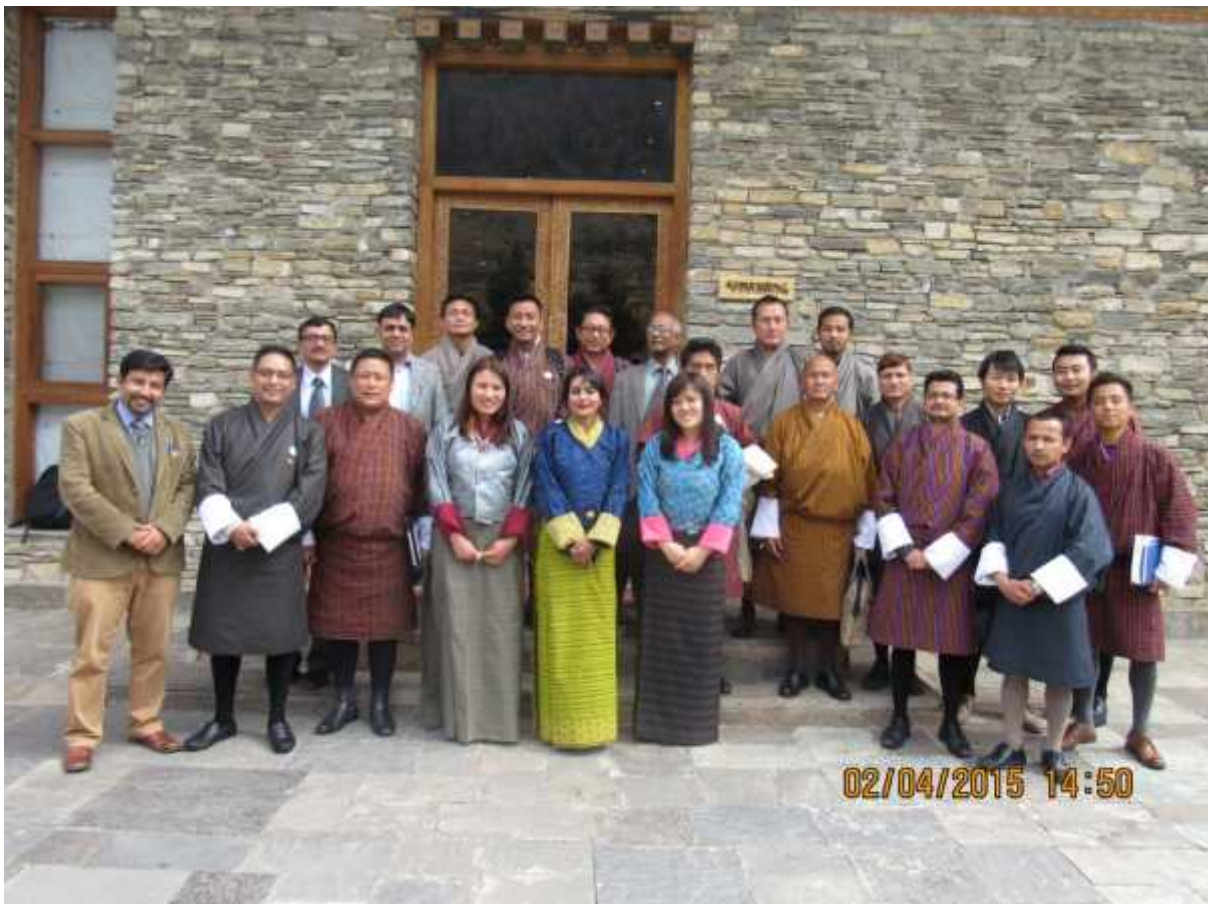
Fig 8. Group photo